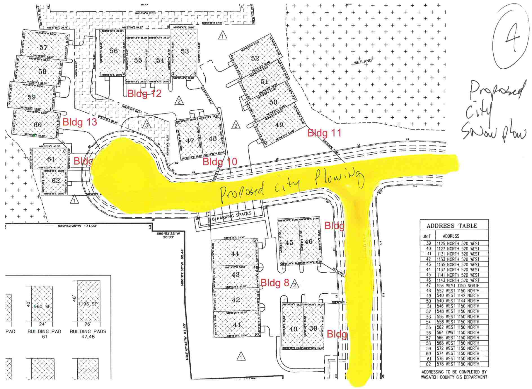
Lodges at Snake Creek – Second phase