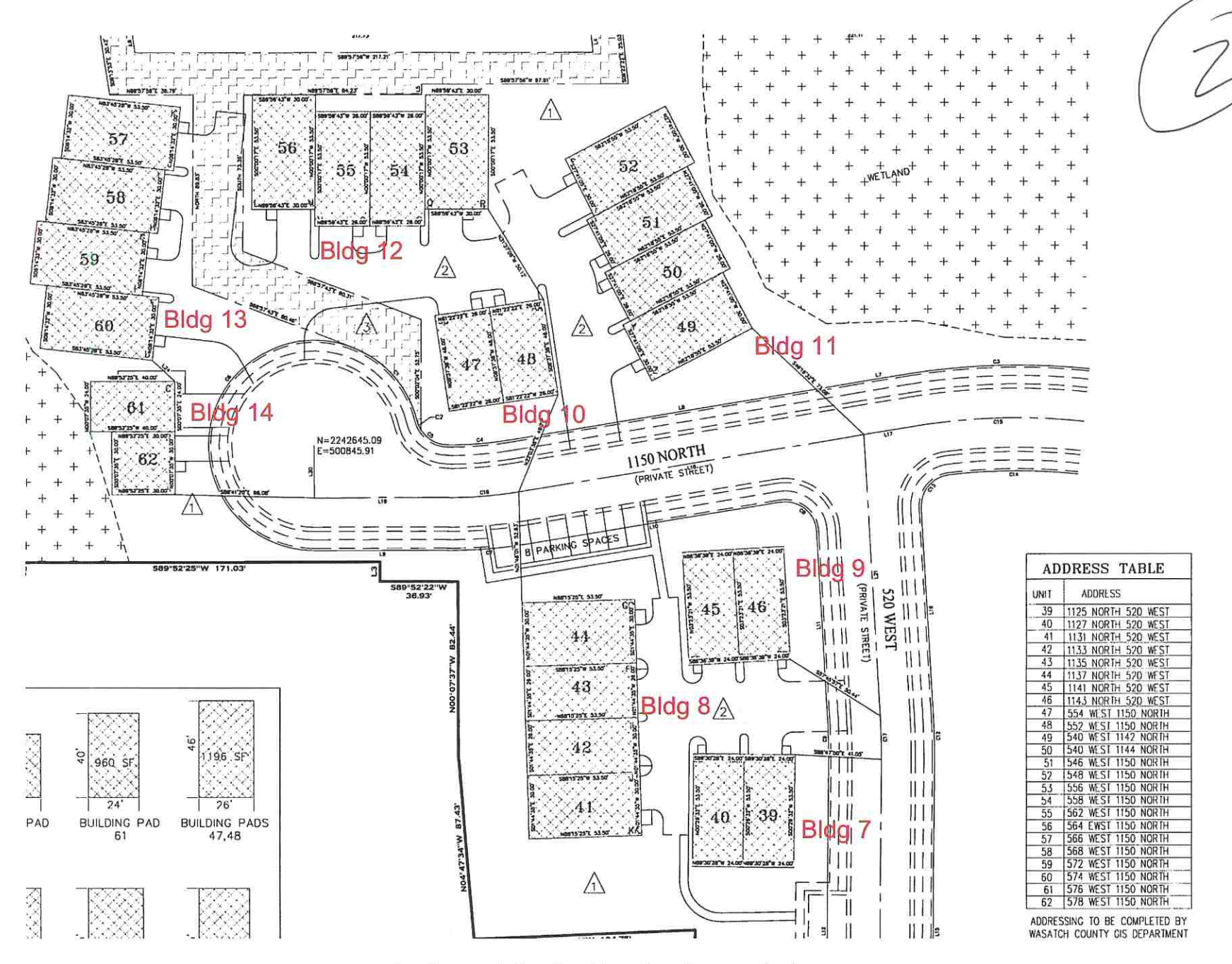
Lodges at Snake Creek – Second phase